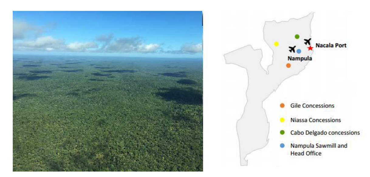
Madeiras concession and Forestry operations locations in Mozambique.